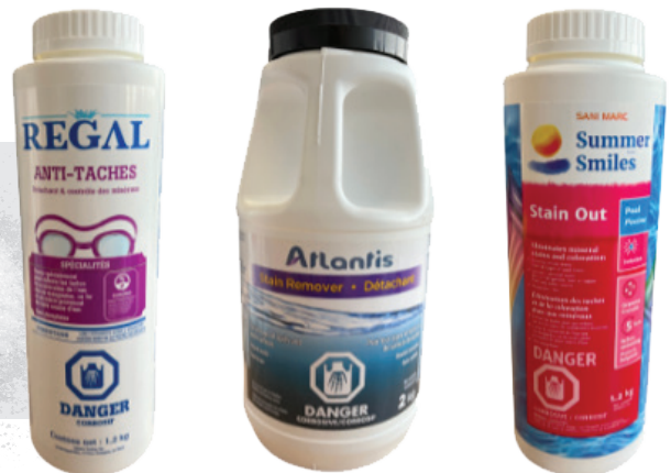
SUGGESTED BRAND NAMES